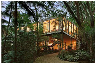
Figure 1. 'Casa de Vidro' [the Glass House] 1 , Lina Bo Bardi, 1951, Morumbi, S. Paulo, Brazil.

Therefore, landscape is also an outside. Architecture may not ignore landscape, but there are different ways to acknowledge landscape. Some of them regard landscape as an element, as decisive as materials, light, proportion, shape, detail, or temperature. Such architecture ranks landscape as a constructive element to be taken into account in design decisions.