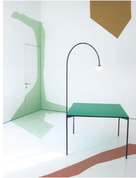
Figure 6. Muller Van Severen, table + lamp, 2011.

In their oeuvre balance is a key word: delicate lines and bold colours, transparency and fullness, geometry and exuberant colour variations, static composition and the suggestion of movement.