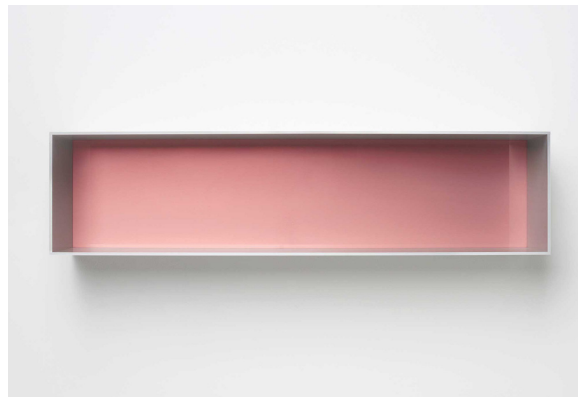
Figure 1. Donald Judd, Untitled 1988 .

It was his goal to put an emphasis on the perception of space, volume, light, colour and materials as such as it is depicted in Untitled 1988 (Fig. 1.), a minimalist object made of clear anodized aluminium and amber Plexiglas (Judd, 2016).