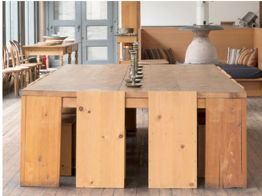
Figure 3. Donald Judd, wooden table and chairs in Judd's living and working space in New York.

“No interpretation is possible, the power of expression equals the functionality” (Judd, 1993, p. 7). A table is a table (Fig. 3) (Judd Foundation, 2016).