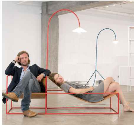
Figure 7. Muller Van Severen, duo seat + lamp, 2011.

More than one person can use the object at the same time for different purposes. According to Max Fraser the collection displays a “romantic implication of togetherness”. Functionality is important, they fill in this requirement in an imaginative way. Muller and Van Severen put their designs to the ultimate test, they live with them to evaluate and perfect them (Fraser, 2014, pp. 160-161).