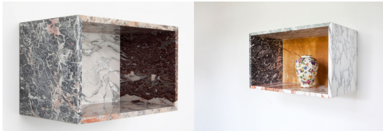
Figure 8. Muller Van Severen, marble box, 2011.

These minimalist and baroque parental influences merged in marble box (Fig. 8), in which Muller Van Severen fuse exuberant materials with a minimalist geometric form. This object is part of their furniture project (Muller Van Severen, 2016). Marble box is an example of the transformation of a piece of furniture, when used by the owner to store books or all kinds of objects, into a work of art when not used.