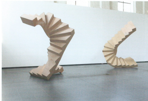
Figure 5. Hannes Van Severen, Staircases, 2010, wood, 350 cm x 200 cm.

Hannes Van Severen is a sculptor who prefers to make larger, common objects like stairs and wardrobes to which he gives an absurd twist. The confrontation of his sculptures with the surrounding space is important to him (Fig. 5). He wants to create new perceptive landscapes with his installations (Meplon, 2014, pp. 164-166).