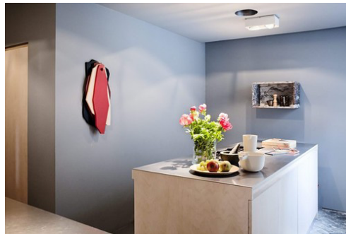
Figure 10. Muller Van Severen, Cutting boards and marble box, 2011.

The couple experiences no fundamental difference between the joint furniture design process and the process of making art separately. Their artistic background remains the most important, they look for new ways to make a piece of furniture more interesting in a sculptural sense, to connect it in a new way with the space it occupies (Meplon, 2014, pp. 164-166). While designing furniture they work in an instinctive, organic way and use simple techniques to