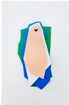
Figure 9. Muller Van Severen, Cutting boards, 2011.