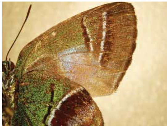
Figure 2. Annamaria ganimedes (Cramer, 1775) (French Guiana) ventral forewing reflector situated caudally to vein Cubitus and Media 3 plus postbasal androconia (forewing length measured from the erection of the vein Radius to apex is 17 mm)

Etymology: The name is an anagram of Annamaria , using to signify the historical connection of the two genera.