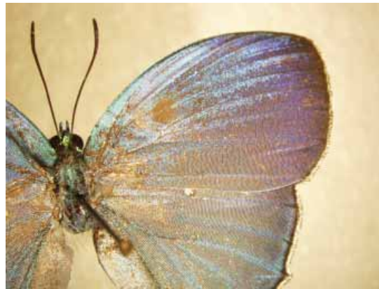
Figure 5. Airamanna rhapsissima (Johnson, 1991) dorsal wingsurface androconia with reduced postdiscal scent patches, minute scent pad in the apex of the discal cell and dispersed androconia in the postbasal area of the forewing and hindwing discal cells (forewing length measured from the erection of the vein Radius to apex is 17 mm)

In the case of Airamanna rhapsissima (Johnson, 1991), new combination , the six male specimens known for me (JOHNSON, 1991: Fig. 31; BÁLINT, 2005b: Figs. 4-5, 16; D'ABRERA, 1995: Fig. "E. mirabilissima"; ROBBINS & LAMAS, 2008a: Fig. 19) have androconial scales dispersed amongst colour rising cover scales in the postbasal area below the vein Cubitus, the scent pad in the apex of the discal cell appears as a minute silvery spot, and the postdiscal androconia is also reduced, but there are androconial scales also dispersed with colour rising cover scales in the discal cell of the dorsal hindwing surface (Fig. 5).