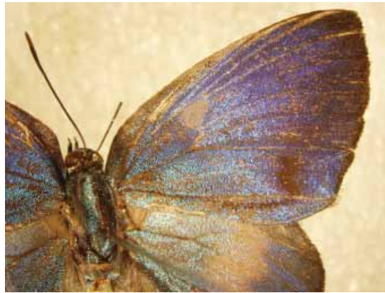
Figure 1. Annamaria ganimedes (Cramer, 1775) (French Guiana) dorsal forewing androconia: postbasal scent patch below the vein Cubitus, scent pad in discal cell apex, and tornal scent patch (forewing length measured from the erection of the vein Radius to apex is 17 mm)

these species and Airamanna . The males of the two known species of Fasslantonis Bálint & Salazar, 2003 (type species: Thecla episcopalis Fassl, 1912) (HALL & WILLMOTT, 2005) possess also an extensive ventral forewing blue reflector. The two or three species of the genus Fasslantonius (Bálint, in preparation) also display sexual dimorphism similar to that of Airamanna : the male ventral hindwing further comprised by black elements in structurally coloured ground colour associated with commonplace female eumaeine ventral pattern). Further investigations are needed to reveal whether this phenomenon indicates closer relationship or not.