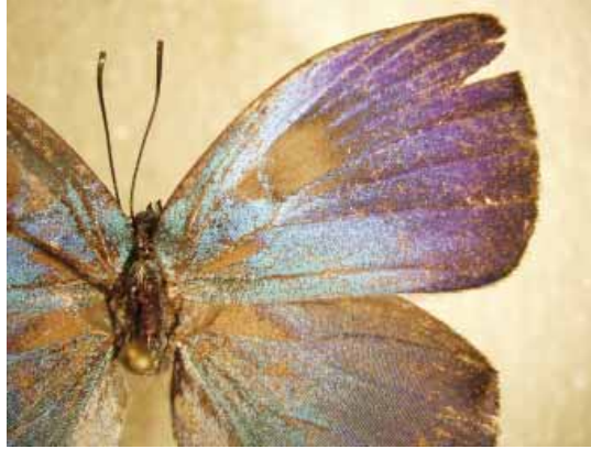
Figure 6. Airamanna rhapsodia (Bálint, 2005) dorsal wings surface androconia with conspicuous scent patches in the postbasal and postdiscal area of the forewing, plus large scent pad in the apex of the discal cell; hindwing surface also with postbasal scent patch above the vein Radius plus androconial scales dispersed amongst colour rising cover scales in the discal area. (forewing length measured from the erection of the vein Radius to apex is 18 mm)