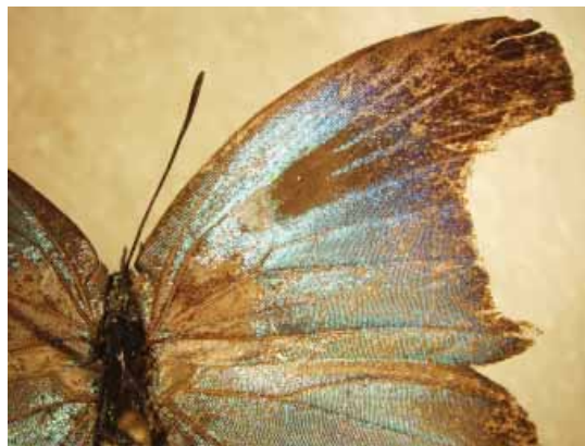
Figure 4. Airamanna columbia (Bálint, 2005) dorsal wingsurface androconia with forewing postbasal and postdiscal scent patches and scent pad in the apex of the discal cell (forewing length measured from the erection of the vein Radius to apex is 21 mm)

In the case of Airamanna columbia (Bálint, 2005), new combination , the four known individuals (SALAZAR, 1993: Figs. 2-3; ROBBINS & LAMAS 2008a: Fig. 18, plus two males collected by Carlos Prieto: Fig. 3) have identically large postbasal forewing dorsal scent patch comprised by large brown scales, a large scent pad comprised by small silvery scales in the apex of the discal cell and a postdiscal scent patch of darker brown scales covering medial area bordered by the veins Radius and Media 3 and extending distally along the medial veins (Fig. 4).