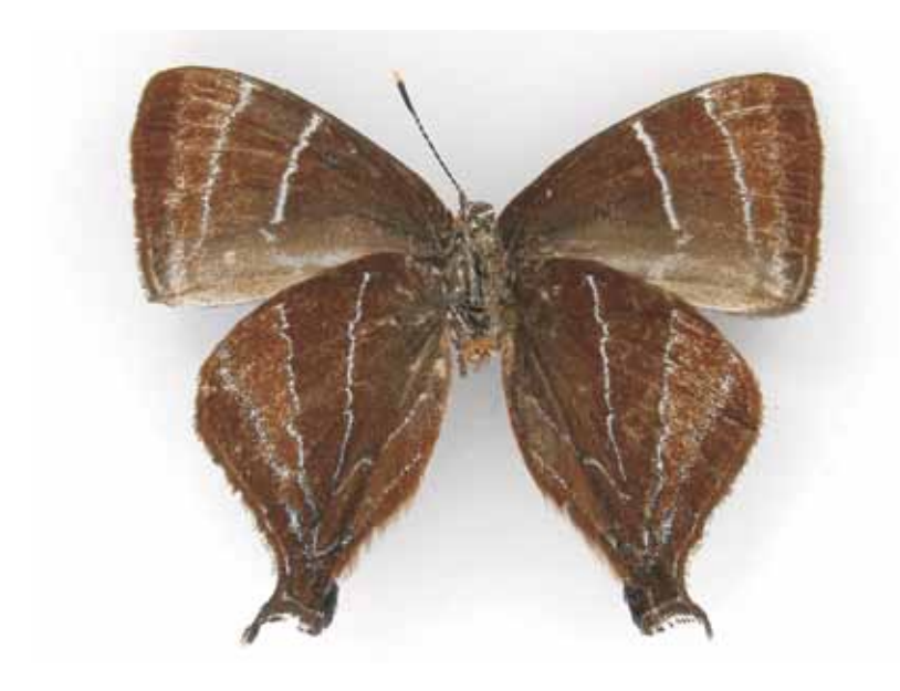
Fig. 2. Holotype of Ianusanta ianusi Bálint, sp. n. in ventral view.