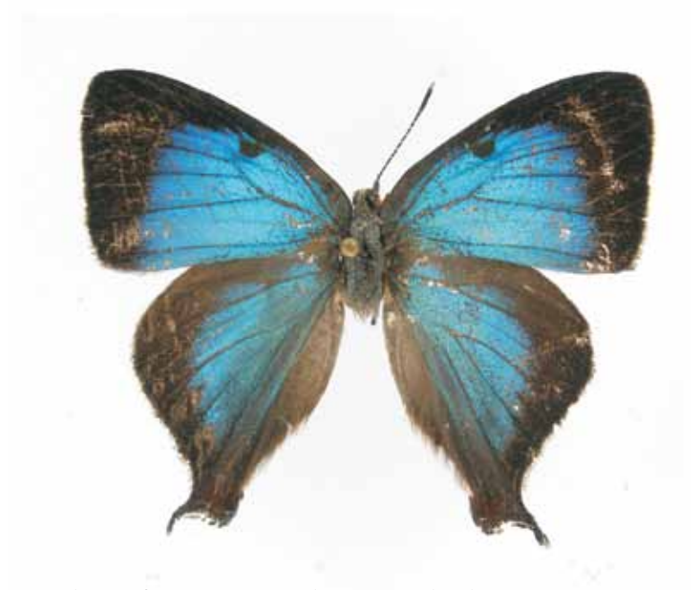
Fig. 1. Holotype of Ianusanta ianusi Bálint, sp. n. in dorsal view.