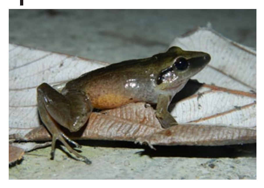
Figure. 1. Individual of Pristimantis achatinus (SVL 38.8 mm) from which the sample of Sarcophagidae larvae was recorded.